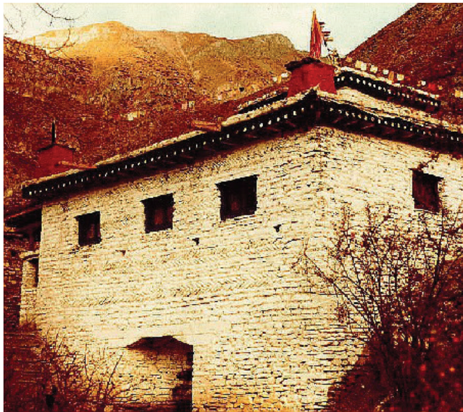
The "Temple Of Miraculous Fire" at Muktinath, Nepal. Photo by Ken Street (Nov. 1979).

[For more on this subject, please read our tract The Temple Of Miraculous Fire .]